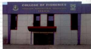
College of Fisheries