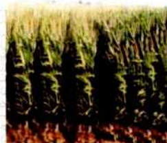
GHB - 719