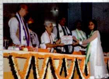
Seventh Annual Convocation