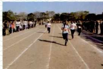
Athletic Competition of Students

The campus interviews were arranged for placement of students of different colleges. Total 19 inter-collegiate sports and cultural / literary activities organised by the University every year. The University students participated in All India Inter Agricultural University Sports and Games Meet from 2004-05 to 2011-12. Students also participated in SAU's (Gujarat) Inter Agril. University sports tournaments and so also in Cultural-Literacy Competition at State and National level. Students were also participated in Inter University National Debate Competition, All India Agricultural Universities Youth Festival and Basic Rock Climbing Course. Under NSS, several programmes were organised. Educational tours were arranged for the students of College of Agriculture, College of Agricultural Engineering & Technology and College of Fisheries Science. Various scholarships were availed to the students. About 58 spiritual and health awareness programmes were organised.