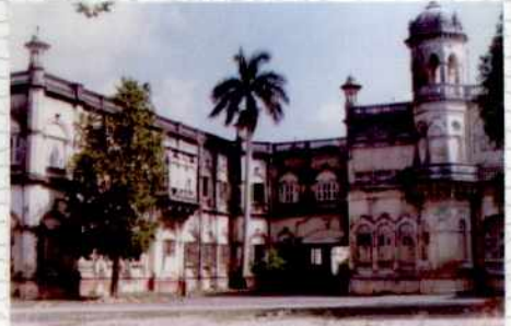
College of Agriculture, Sardarbaug (1960)

The agricultural education in Saurashtra region of Gujarat State started way back in 1960 with the establishment of College of Agriculture in a palatial building at Sardarbaug, Junagadh. The college was affiliated to Gujarat University, Ahmedabad from its outset till the year 1967.