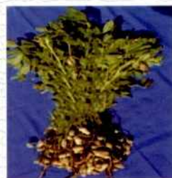
GJG - 22