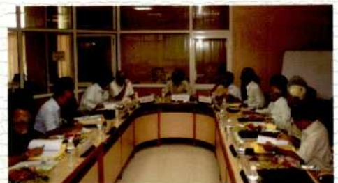
Meeting: Board of Management

The Governor of the State is the Chancellor of the University. The Chancellor, by virtue of his office, as the Head of the University, when present, presides at any convocation of the University.