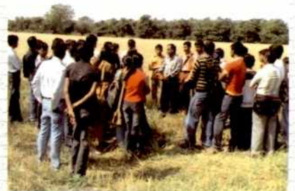
Experiential Learning Programme