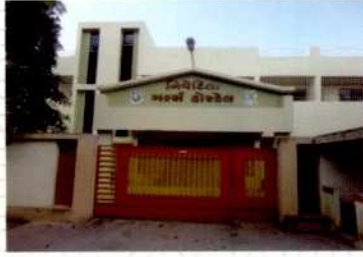
Nivedita Girls Hostel