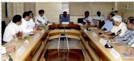
Visit of Punjab Agricultural University, Ludhiana delegation during July 16-19, 2012