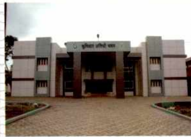
Krushikar Atithi Bhavan