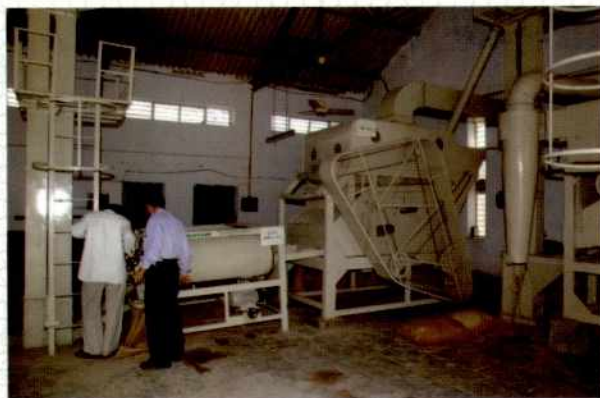
Seed Processing Unit

A spectacular increase in the facilities for seed production, seed processing, seed storage and distribution has been witnessed with the inception of Mega Seed Project. The consequence is noticeable increase in the seed production and distribution of various crops, viz., Groundnut, Wheat, Chickpea, Pearl Millet, Castor, Sesame and other crops of Saurashtra region. Seeds were distributed under the brand name of "Sawaj Beej".