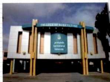
College of Agriculture