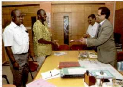
Visit of Delegation from South Africa during November 17-24, 2012