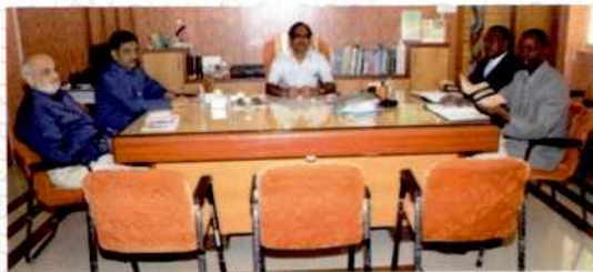
Visit of Tanzania delegation during December 08, 2010