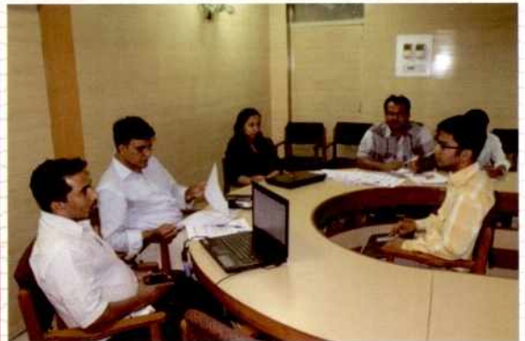
Placement of Student