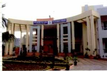
VIP Guest house