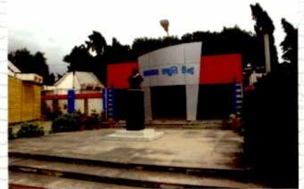
Sardar Smruti Kendra, Junagadh