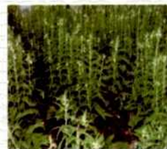
G. Til - 3

Varieties released at national level* and for other state * .