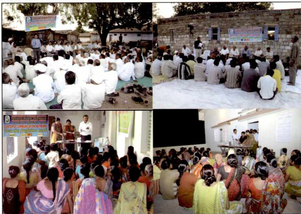
Khedut Shibir under COC and demonstration of Bakery product

Note: Figures in parenthesis indicate no. of beneficiaries.