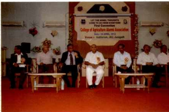
Inauguration of Alumni Association - College of Agriculture

A large number of graduates and post graduates from College of Agriculture, College Agricultural Engineering & Technology and College of Fisheries Science have occupied higher ranks in different departments such as Agriculture, Horticulture, Fisheries, Forest, Police, Custom, Corporate, Civil Services, Banking Services, Pesticides, Fertilizers, Seed Industries and other Institutions. Some of the alumni of this University also reached to the rank of Vice Chancellor and Director of Campus of Gujarat Agricultural University, Director of Agriculture, Minister of Agriculture in the State of Gujarat. They have made significant contributions in upliftment of agriculture.