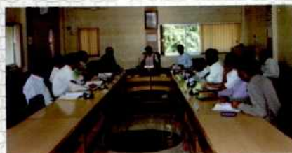
Meeting: Academic Council

Various Boards of Studies, through the Academic Council advise the Board of Management on academic matters. The Research Council and the Extension Educational Council advise the Board on research and extension education activities, respectively.