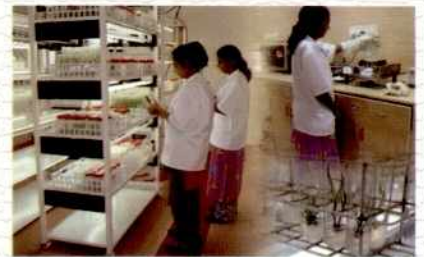
Food Testing Laboratory