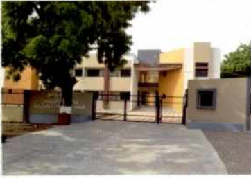
Girls Hostel for Polytechnic at Amreli

The University has a well established library, fifteen hostel blocks for boys and four for girls having capacity of about 1452 students and adequately developed sports complex which is one of the best sports complexes in the Saurashtra.