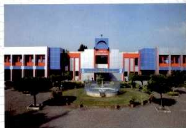
College of Agril. Engg. & Technology