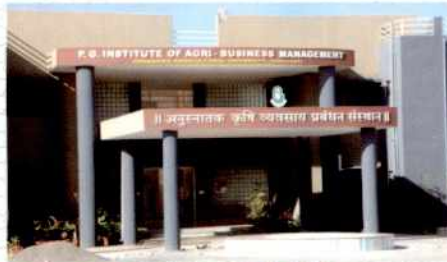
P.G. Institute of A.B.M.