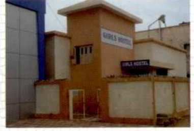
Girls Hostel at Veraval