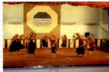
Cultural Program of Students