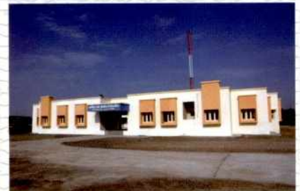
Krishi Vigyan Kendra, Amreli