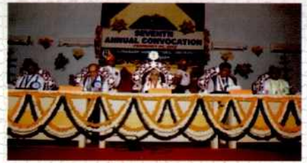
Seventh Annual Convocation