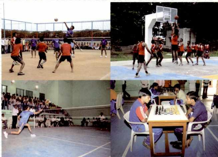
Various Sports Activities

* Figure in the parenthesis indicates the no. of participants, enrolled NSS volunteers, and scholarship recipients.