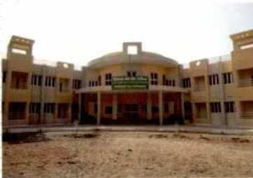
Vivekanand Hall of Residence for UG Boys-CAET