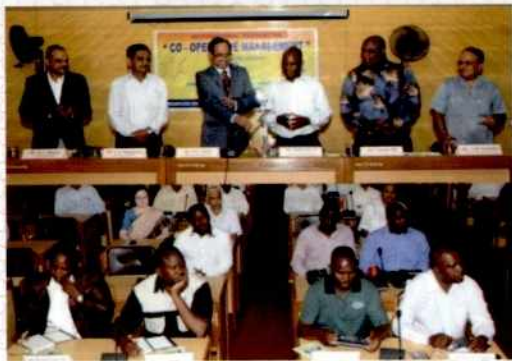
Visit of South Africa Delegation during September 12-16, 2011