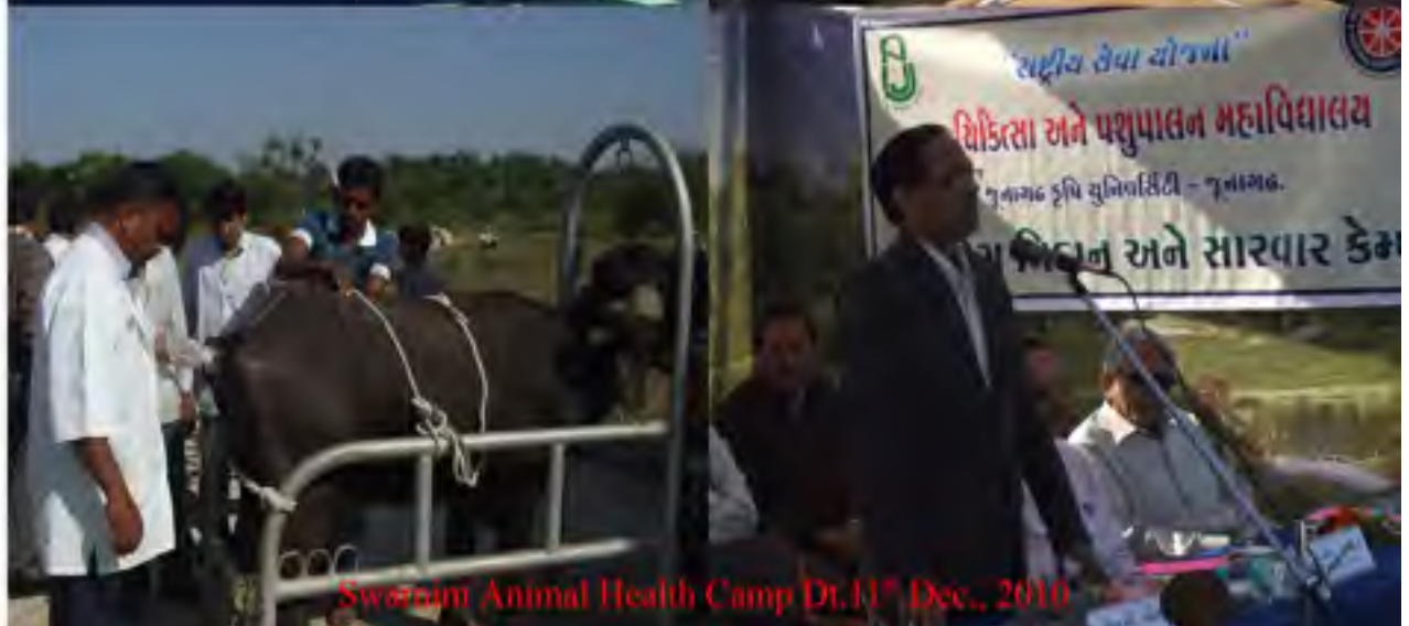
Swarnim Animal Health Camp Dt.11 th Dec., 2010