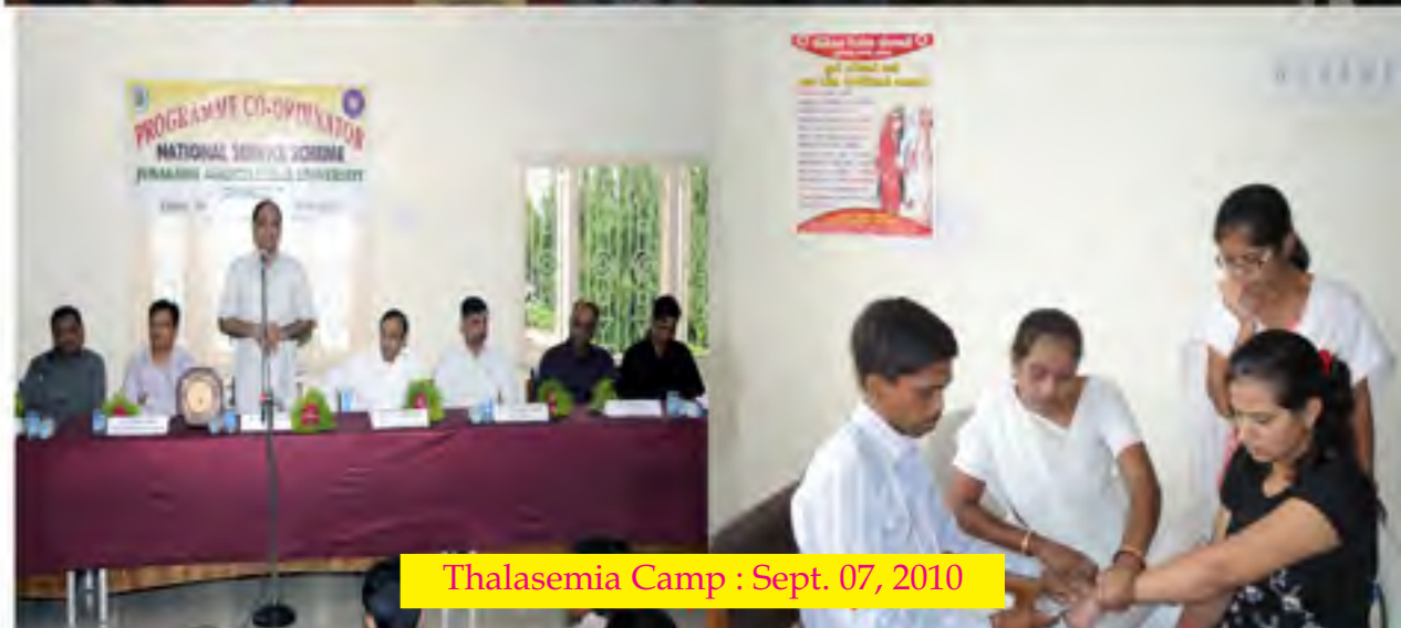
Thalassemia Camp : Sept. 07, 2010