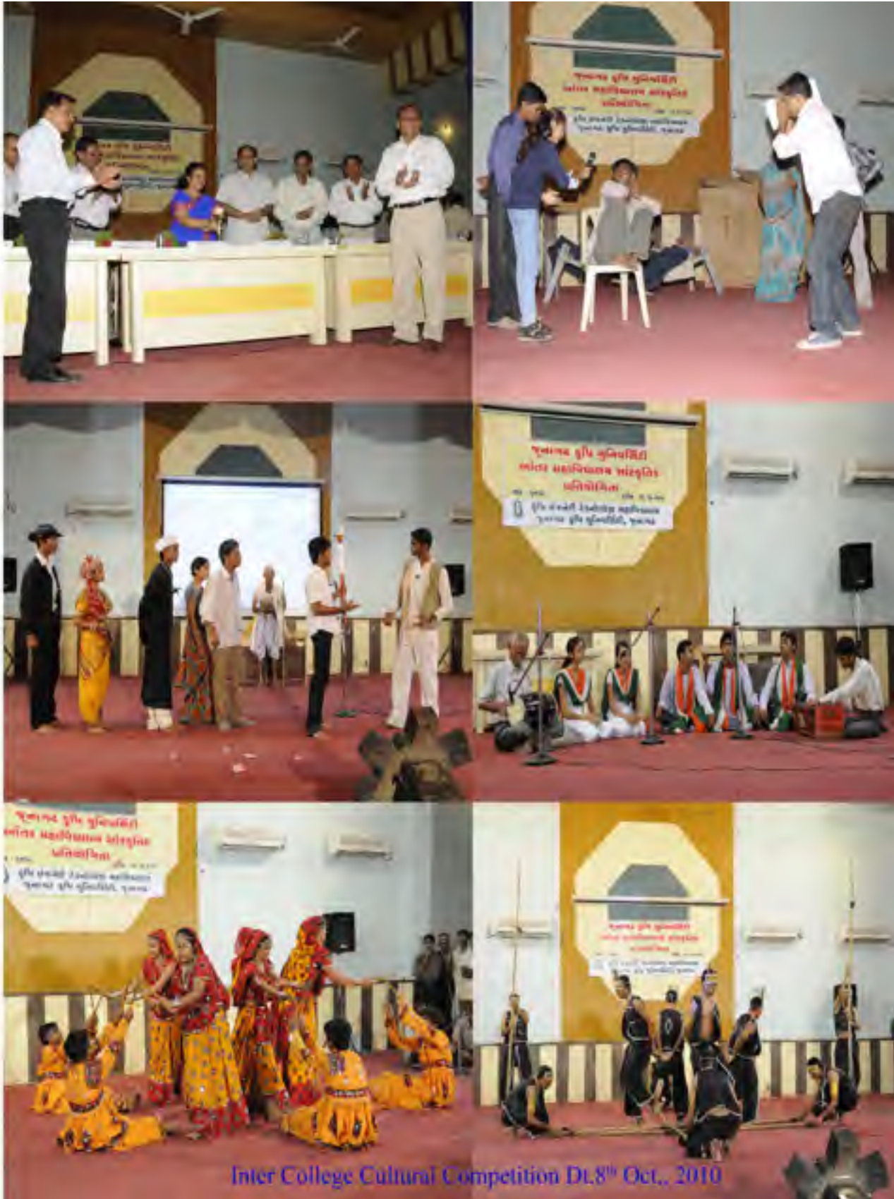
Inter College Cultural Competition DL8 th Oct., 2010