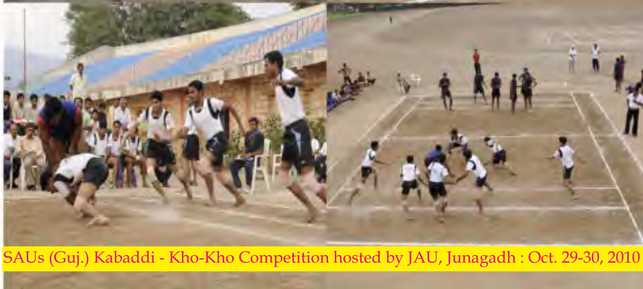
SAUs (Guj.) Kabaddi - Kho-Kho Competition hosted by JAU, Junagadh : Oct. 29-30, 2010