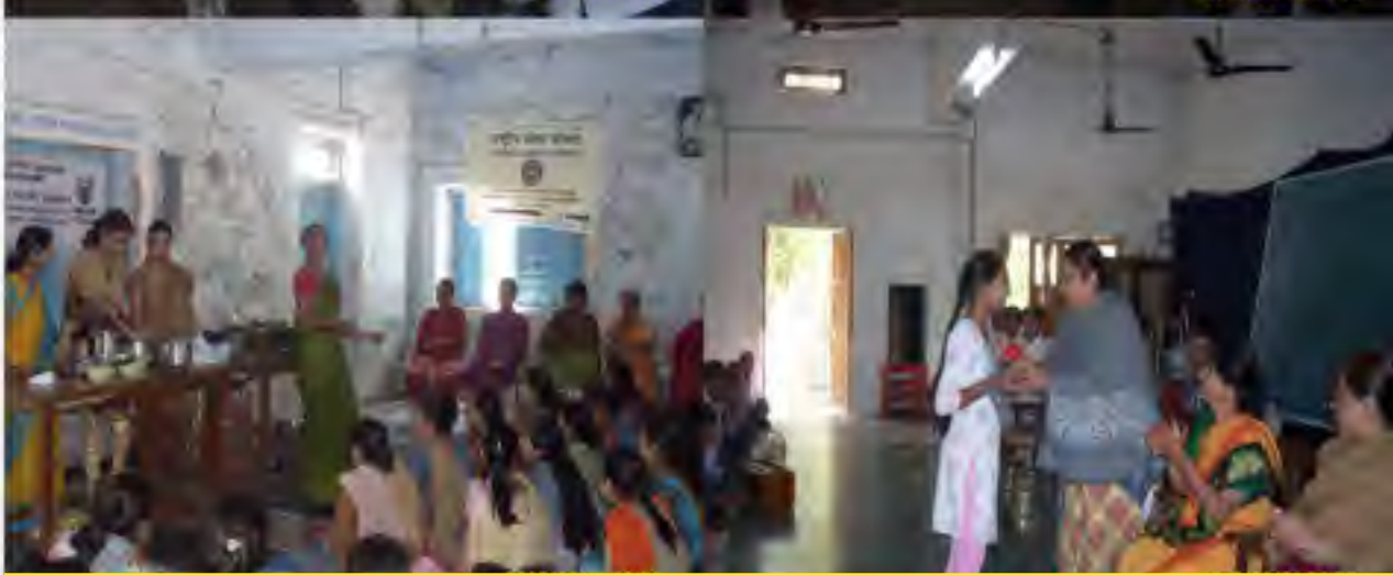
Home Science training : Feb. 28, 2011