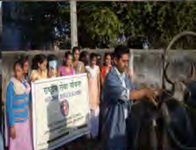
Animal health care in the special camp at Babapur (Ta. Amreli) : Feb. 26, 2011