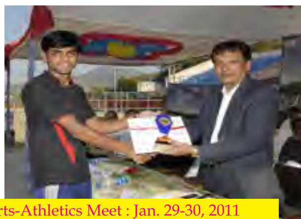
7 th Inter Coll./Inter Polytechnics Sports-Athletics Meet : Jan. 29-30, 2011