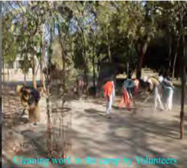
Cleaning work in the camp by Volunteers