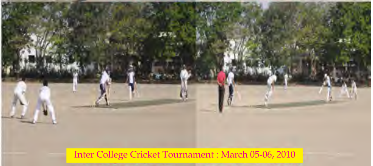
Inter College Cricket Tournament : March 05-06, 2010