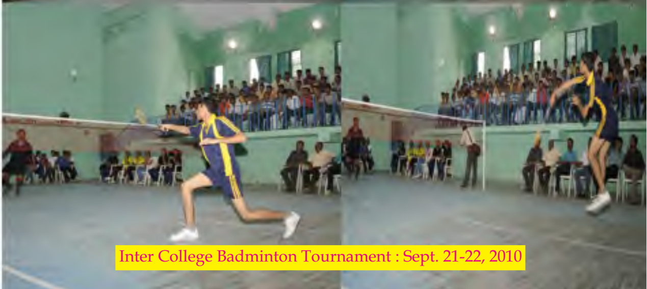
Inter College Badminton Tournament : Sept. 21-22, 2010