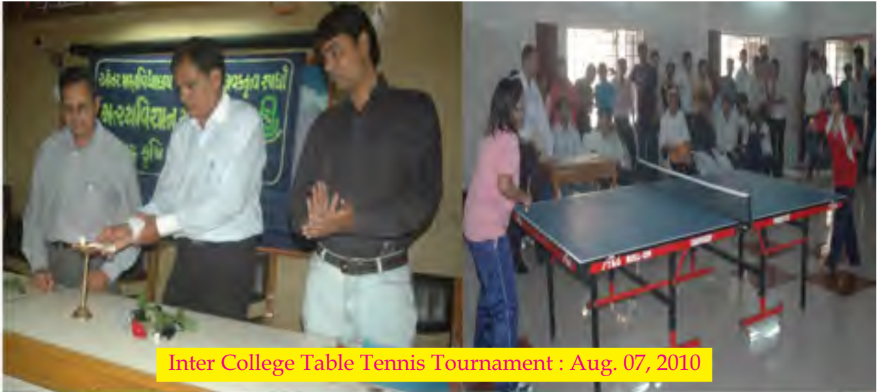
Inter College Table Tennis Tournament : Aug. 07, 2010