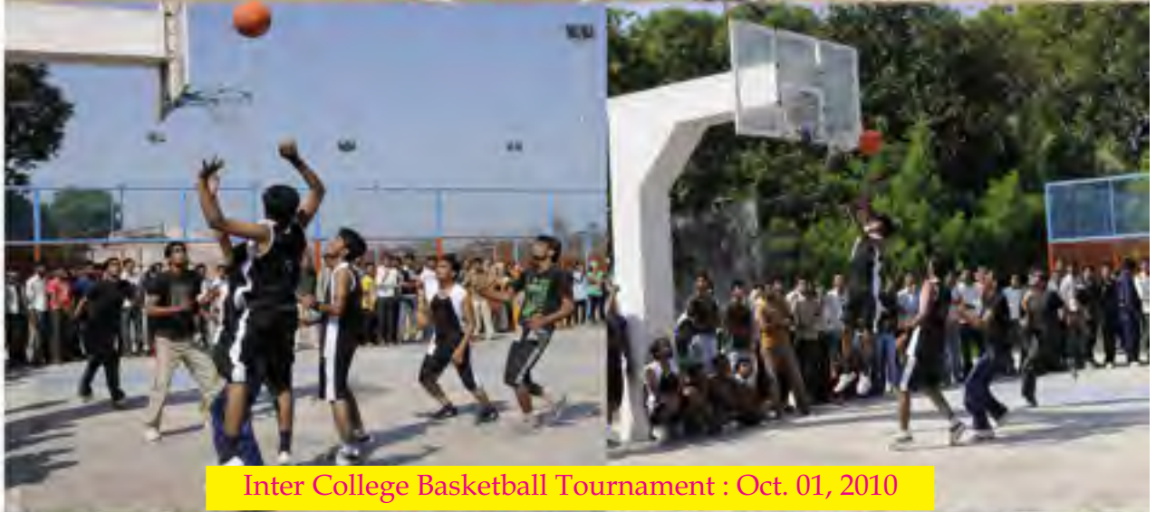
Inter College Basketball Tournament : Oct. 01, 2010