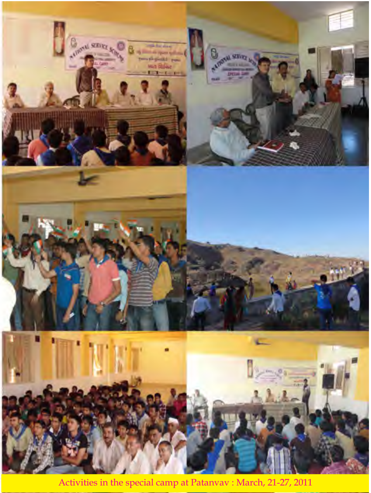
Activities in the special camp at Patanvav : March, 21-27, 2011