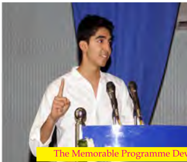
The Memorable Programme Dev Patel, Hero of Slumdog Millionaire