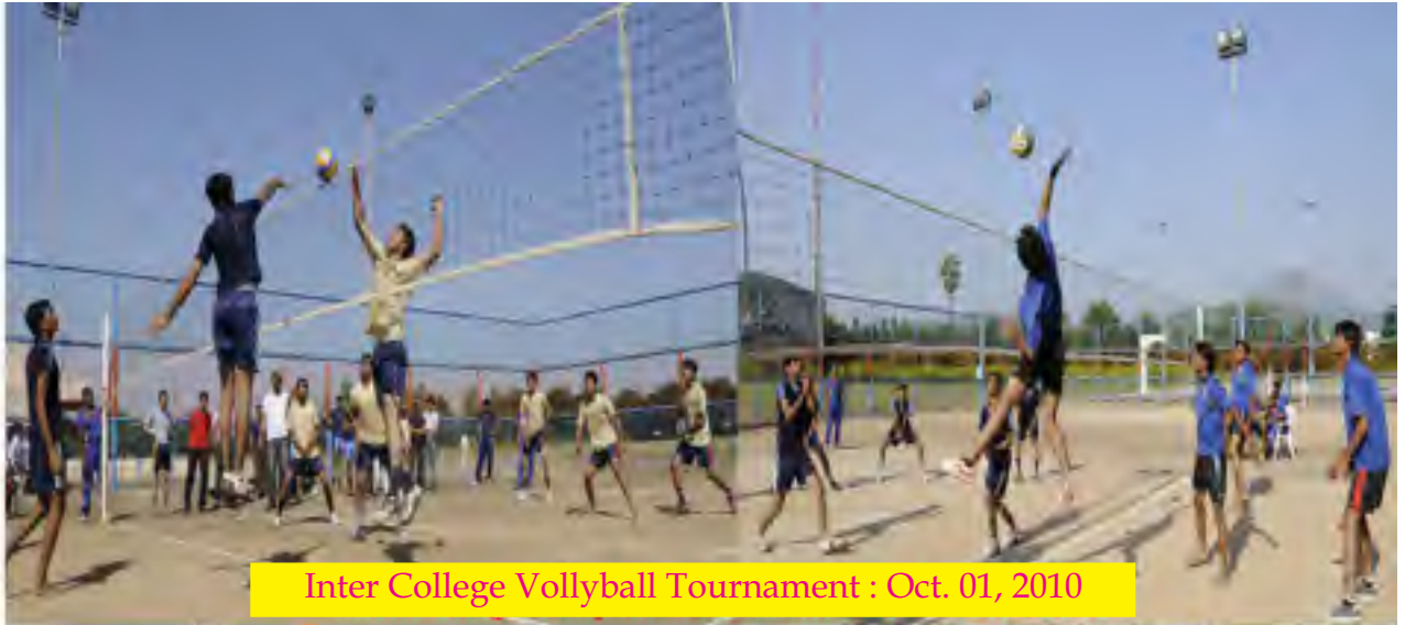
Inter College Volleyball Tournament : Oct. 01, 2010