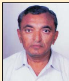
1990-10-M Rabadia P. N.