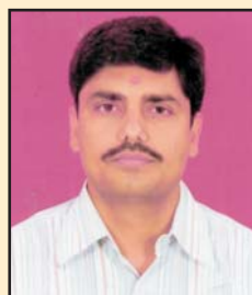
1989-20-B/M Tank R. V.