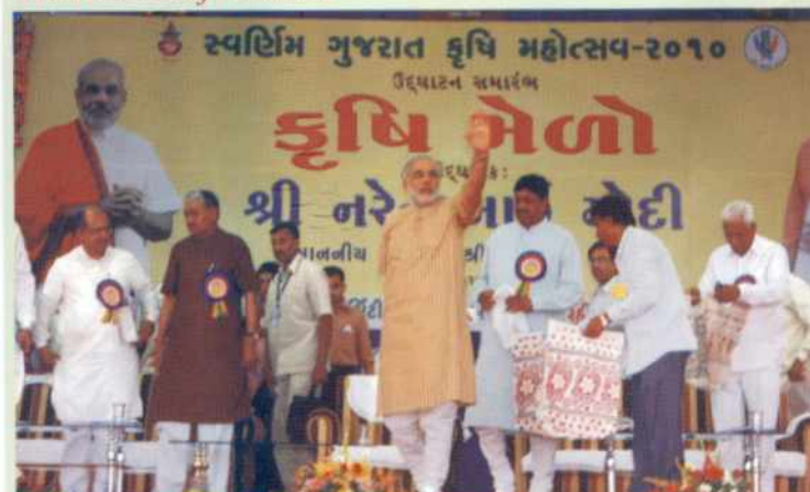
Chief Minister Shri Narendra Modi greeting the gathering at Krushi Mahotsava