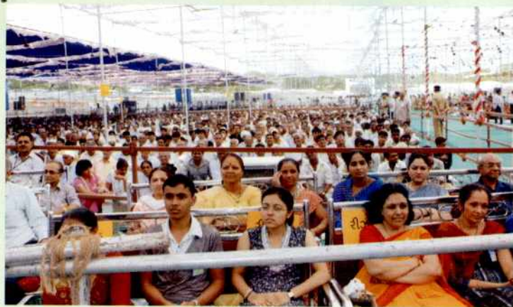
Majestic gathering at the Swarnim Krushi Mahotsava celebration