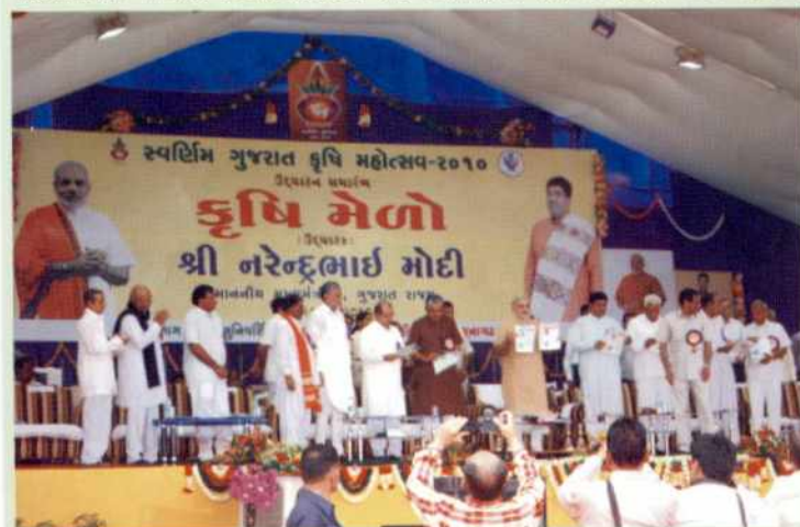
Hon'ble Chief Minister Shri Narendra Modi releasing the publications of JAU Scientists

On the same day of mahotsava seven progressive farmers were felicitated as Krushi na Rushi for their