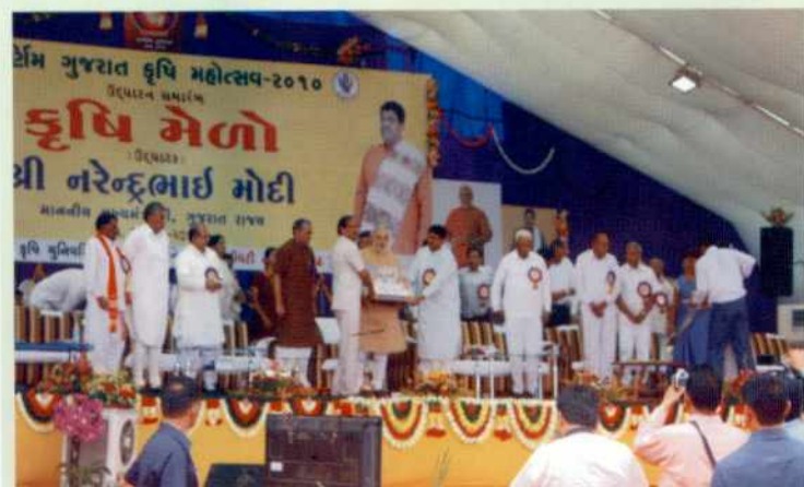
Hon'ble Minister of Agriculture, Shri Dileep Sanghani and Hon'ble VC, Dr. N. C. Patel presenting a memento to Hon'ble Chief Minister

number of farmers in which the experts from different states and national levels provided guidance to them.