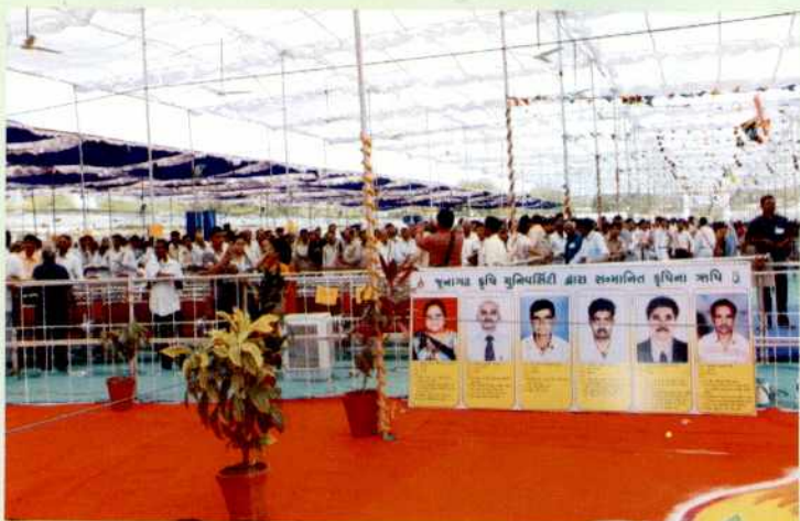
Krushi na Rushi of Saurashtra region felicitated by Hon'ble Chief Minister Shri Narendra Modi