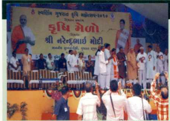
Hon'ble Chief Minister Shri Narendra Modi inaugurating the Swarnim Krushi Mahotsava by lighting the lamp.