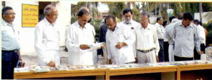
Book exhibition at TARTU PUSTAK KENDRA, JAU, Junagadh.