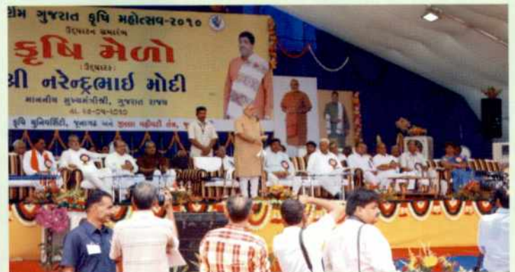
Hon'ble Chief Minister Shri Narendra Modi addressing the mammoth gathering at Krushi Mahotsava

noteworthy achievements. Under the scheme of farmers accident insurance , the heirs of deceased farmers received cheques from Hon'ble Chief Minister. Some publications related to agriculture written by scientists were released. On the next day, a seminar on organic farming was organized which was attended by a large