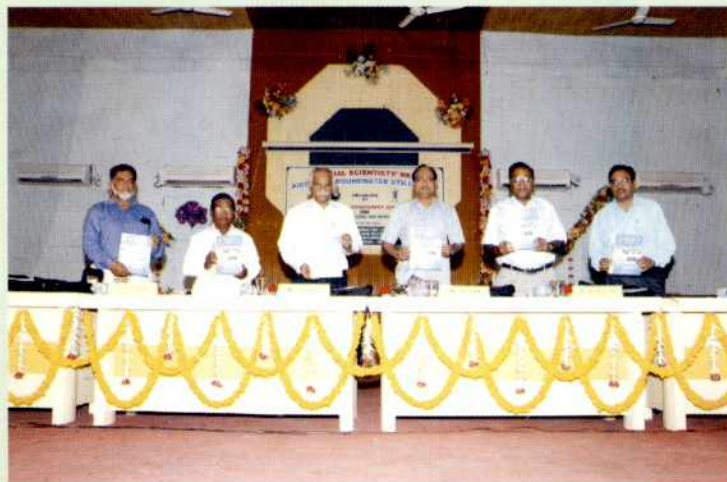
Publications released by the dignitaries, The Biennial Scientists' Meet of AICRP-GWU-2010, April 27, 2010