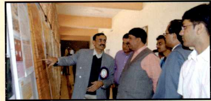
Shri Dileepbhai Sanghani Hon'ble Agriculture Minister observing the poster presented