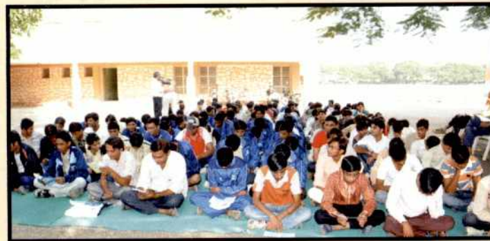
A view of students participation in readathon