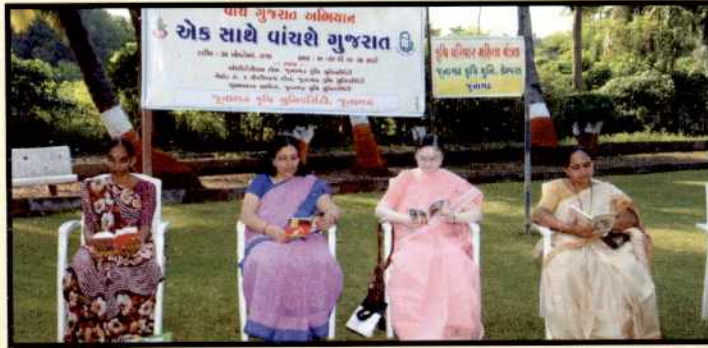
The members of Mahila Mandal participated in Vanche Gujarat Programme