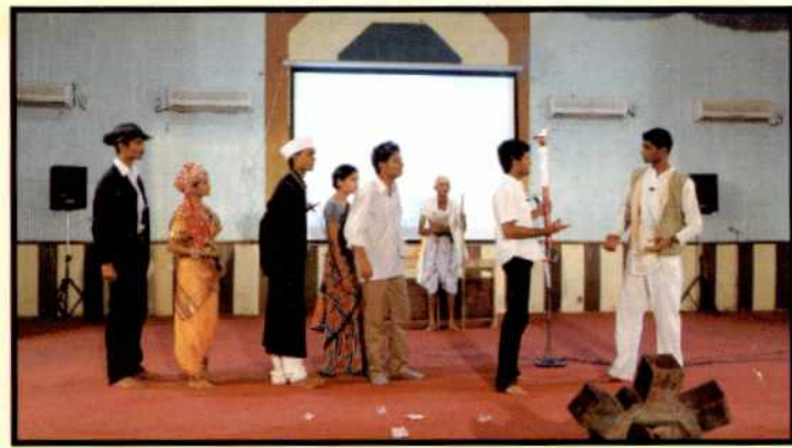
A scene of one act play by students during the inter-collegiate cultural Competitions.