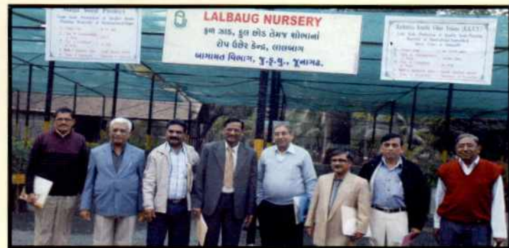
NHB accreditation team with university officers at Lal baug nursery, JAU, Junagadh