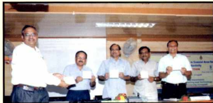
Releasing of e-volume of lecture notes during inaugural function of the winter school