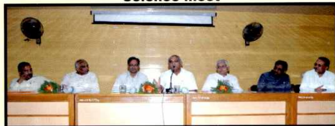
Shri Kanubhai Bhalala, Minister of state for agriculture interacting with the scientists of JAU, Junagadh