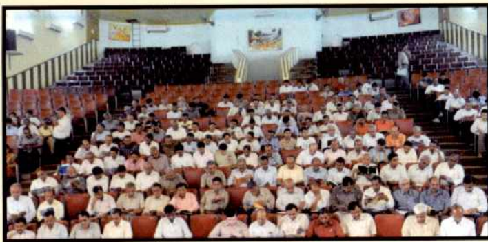
A view of the mass reading programme held at University Auditorium